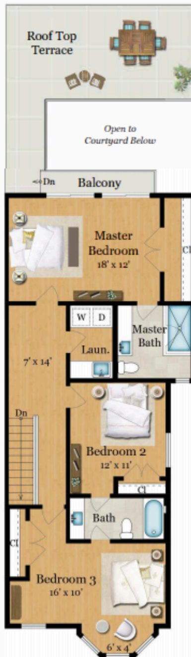
UPPER LEVEL 1,100 SQ FT

Estimated Total Finished Square Footage: 3,170 SQ FT Above-Grade: 2,510 SQ FT Below-Grade: 660 SQ FT Plus 450 SQ FT 2-Car Garage on Lower Level Calculated per ANSI Standard Z7652003.